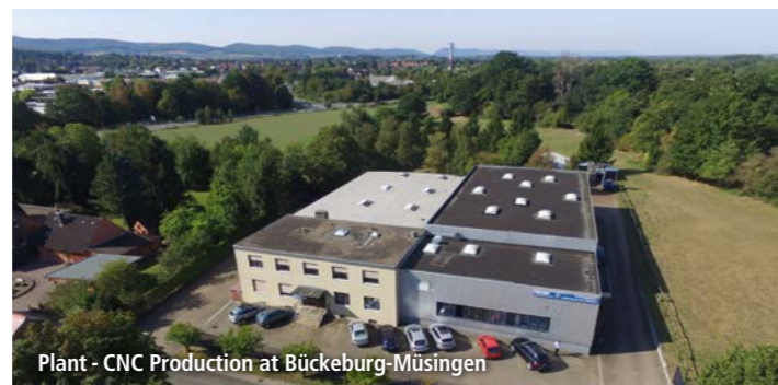
Plant - CNC Production at Bückeberg-Müdingen