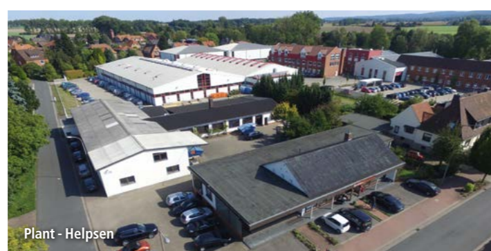
Plant - Helsen

PRECIMA Magnettechnik GmbH was founded in the year 1981 and is today established as an independent, medium sized, innovative family owned brake manufacturer. With our staff of more than 160 employees we develop and produce a wide range of electro-magnetic operated brakes and clutches for all kinds of applications in machine and other industries. Our standard range of products covers a performance scope of braking torques between 0.5 and 1,600 Nm.