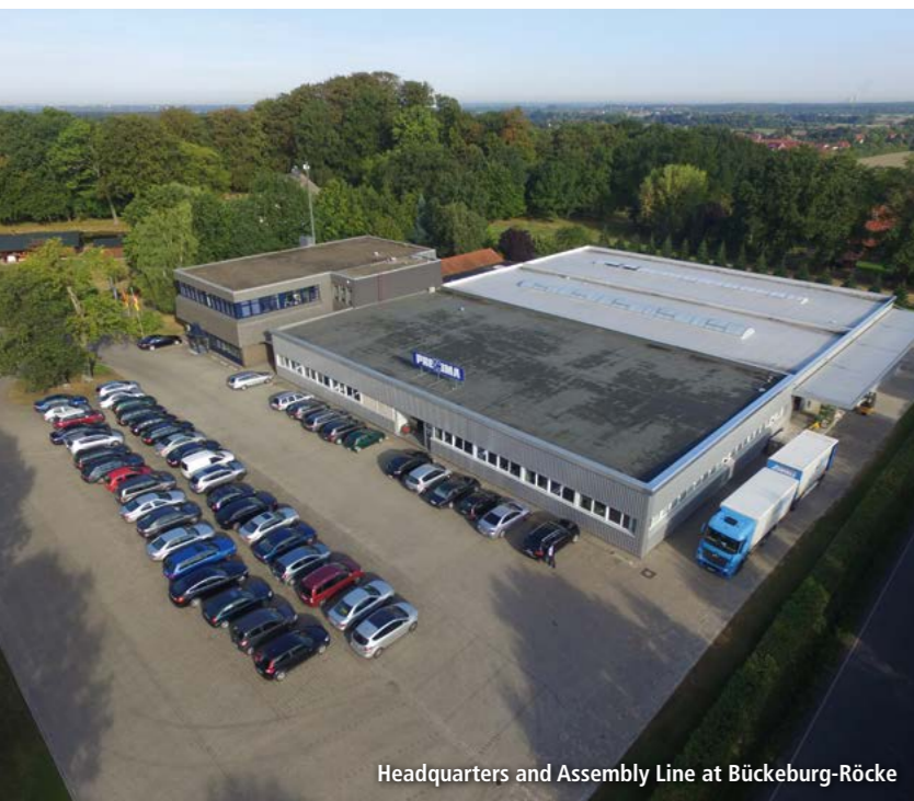
Headquarters and Assembly Line at Bückeberg-Röcke